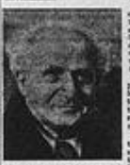
David Ben-Gurion, Prime Minister of Israel, is seen in a portrait. He is wearing a dark suit and a white shirt with a tie. The portrait is framed and set against a light background.

The creation of "Medinat Yisrael" was proclaimed at midnight on Friday, the White House announced, and new head of the State's Government.