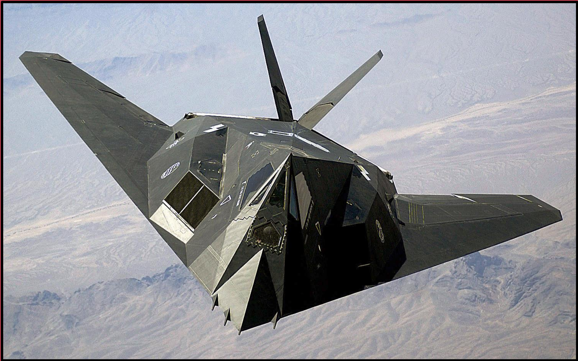
A US Nighthawk – one of the key players in Desert Storm.