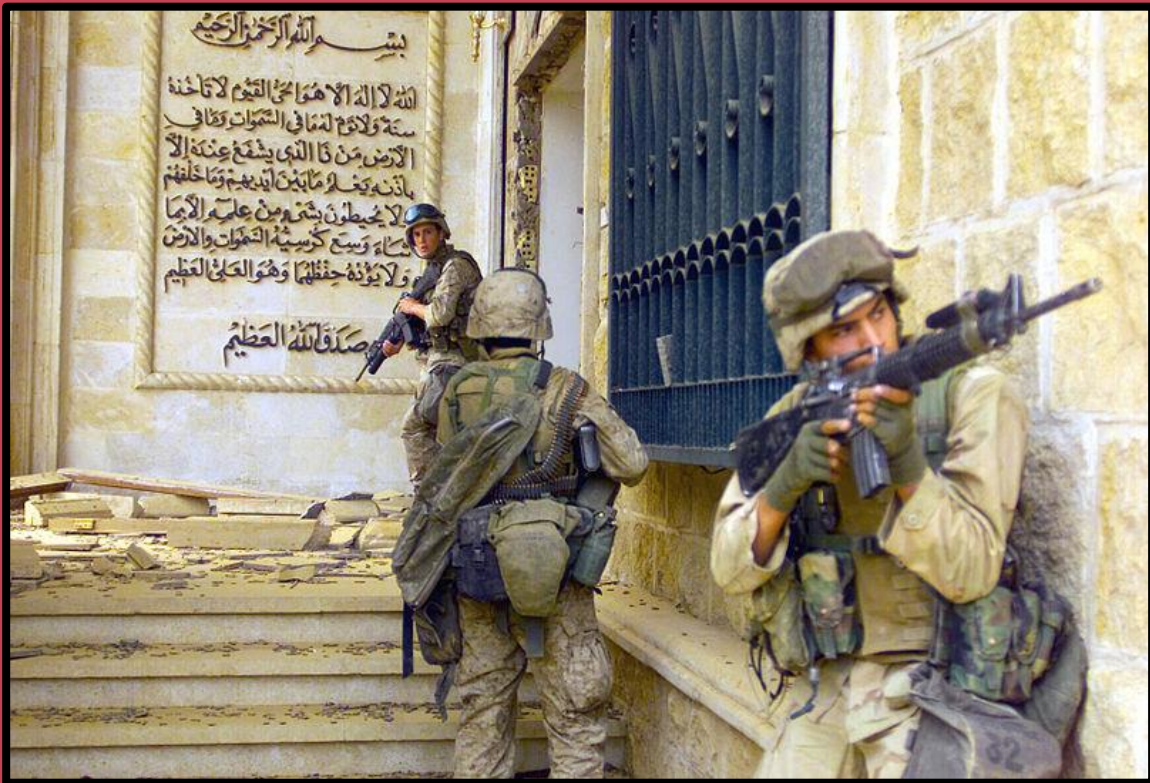
U.S. marines enter a palace in Baghdad.