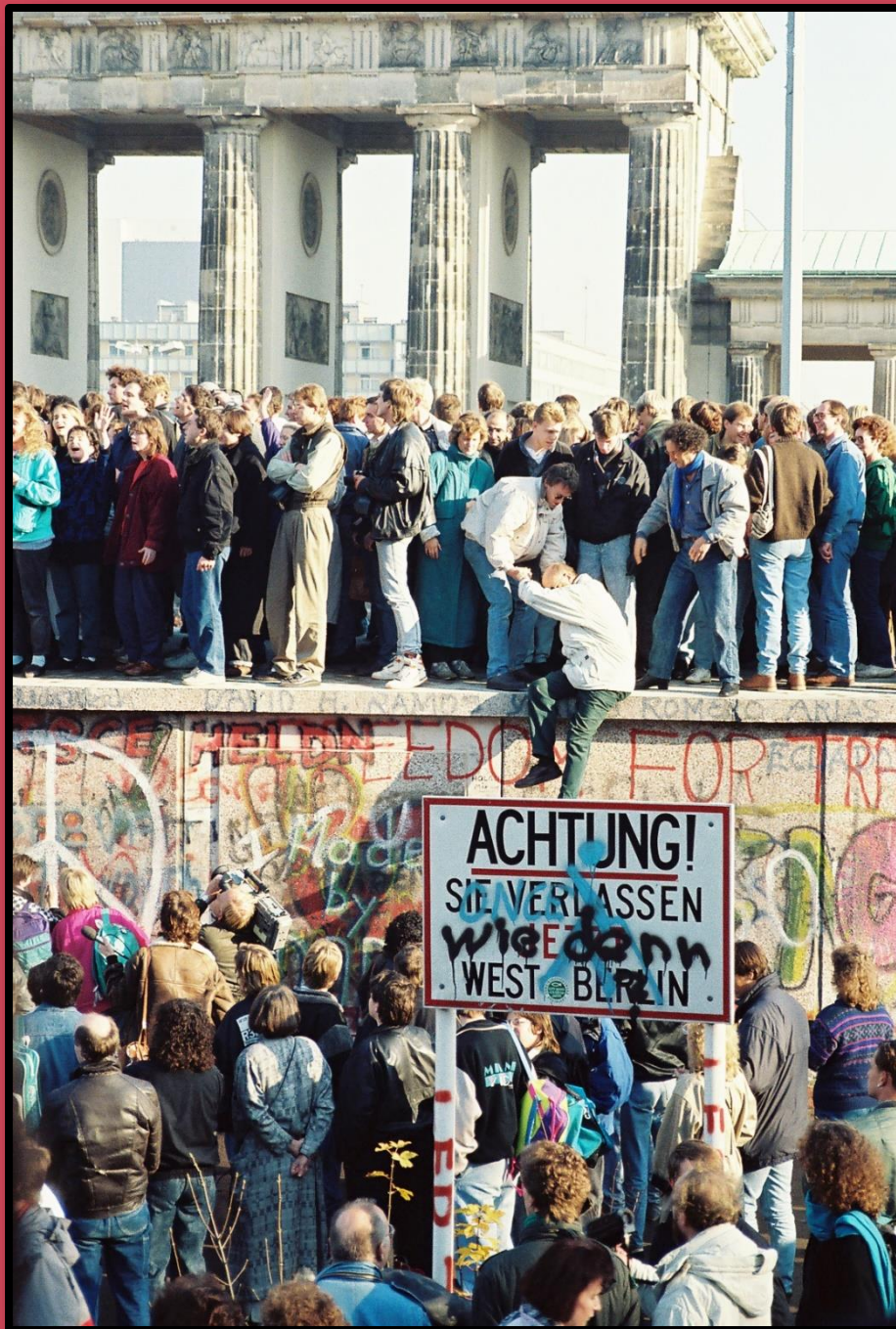
People Climbing Over the Wall - 1989