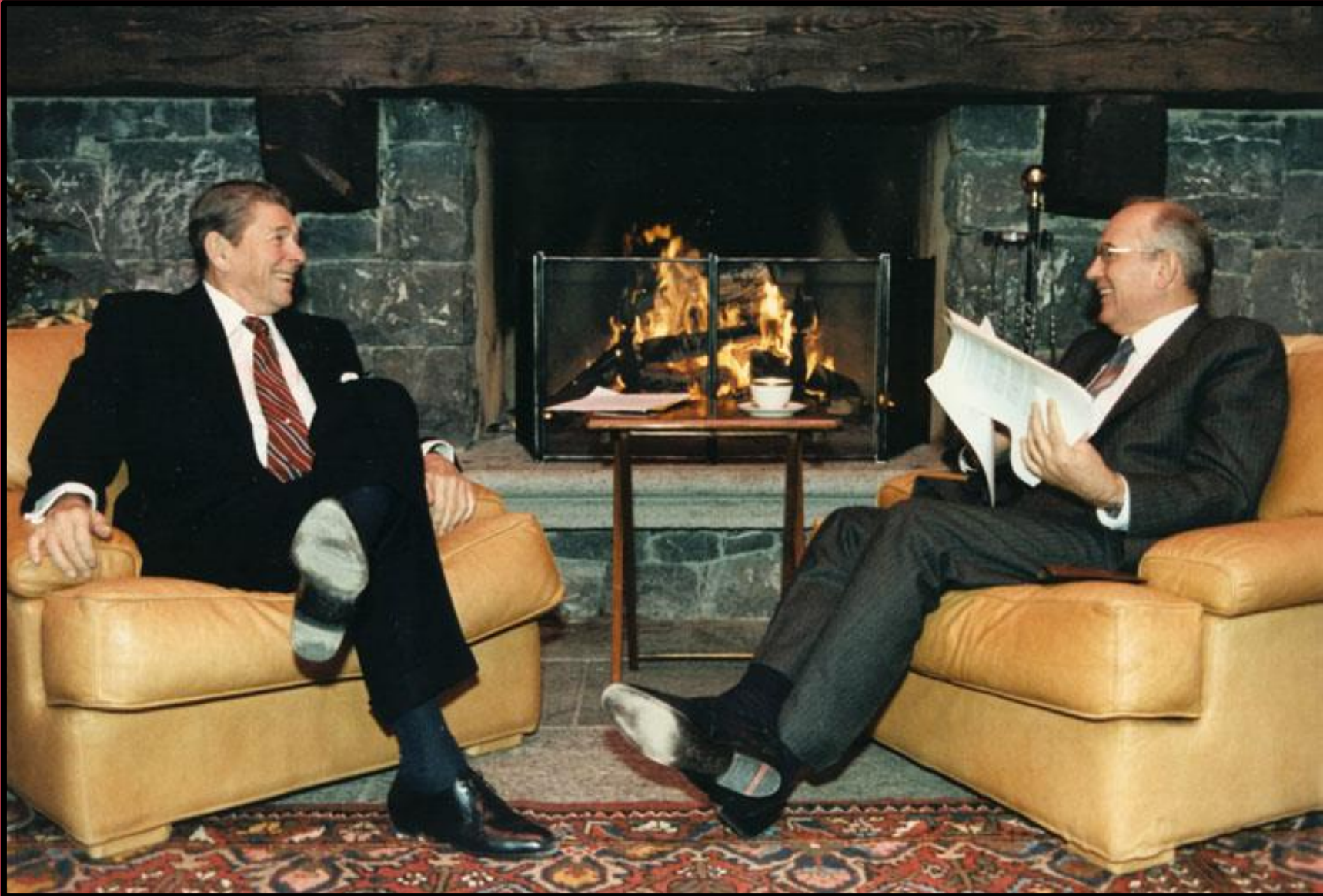
Mikhail Gorbachev in a Discussion with US President Ronald Reagan