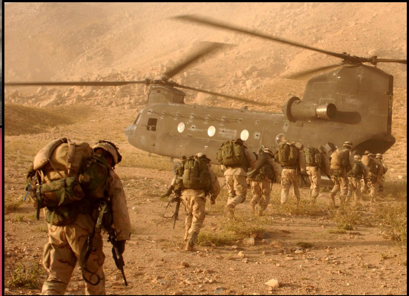
U.S. troops in Afghanistan in 2001.