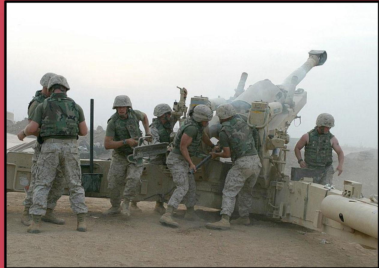
U.S. marines fire a M198 Medium Howitzer.