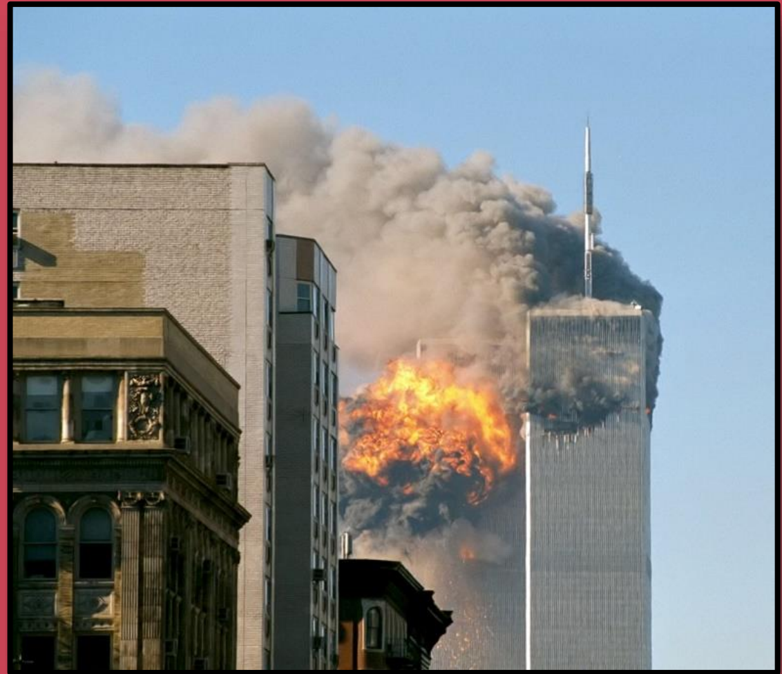
World Trade Center – Before and After