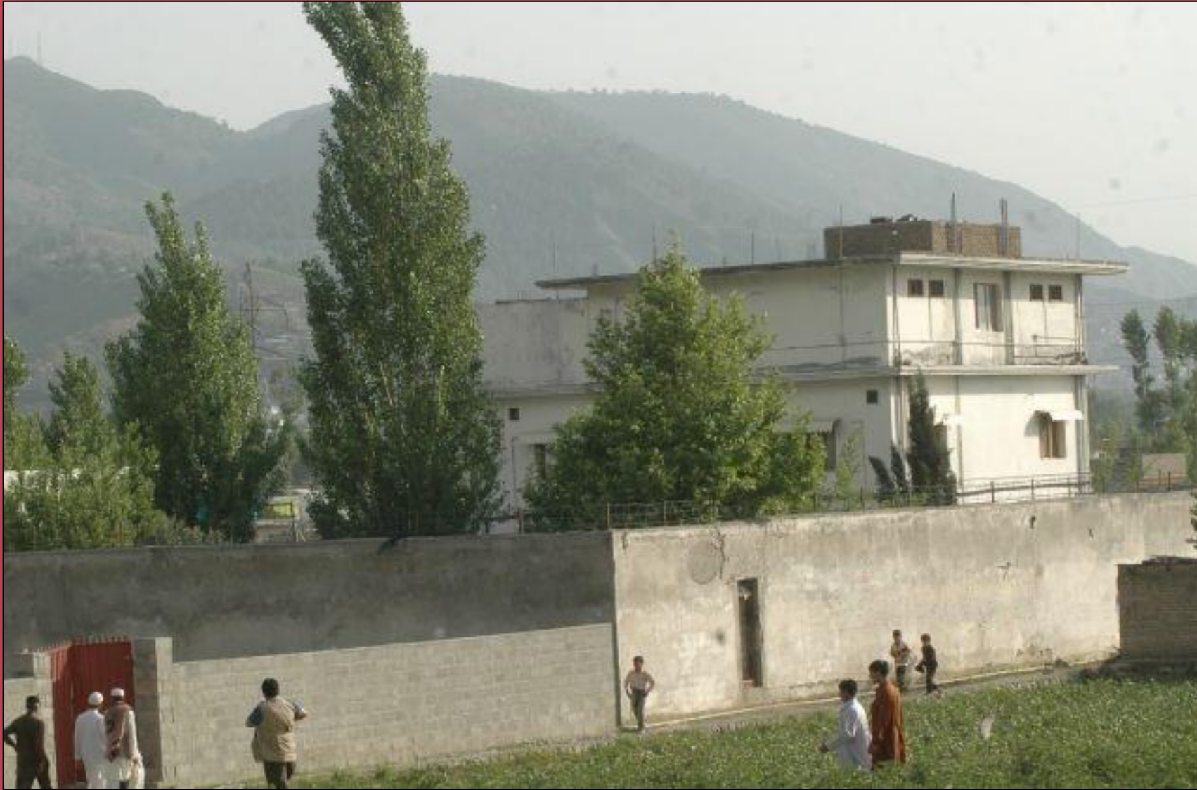
Osama bin Laden's compound in Pakistan where he was found in 2011.