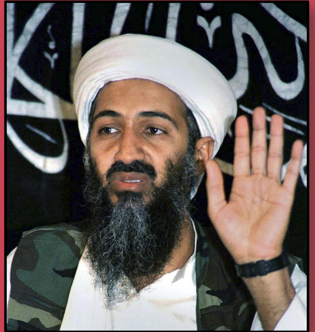
Osama bin Laden